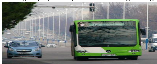
Figure 1. The advantage of using PT.

The efficiency of public transport depends on the safe and rapid flow of involuntary traffic. Intelligent transport technologies play an important role in organizing such traffic flow.